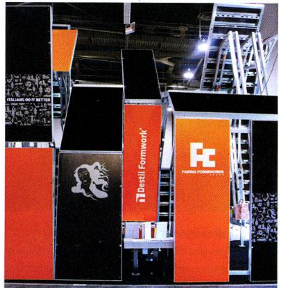
At the World of Concrete, held in Las Vegas from January 22 to 25, Italian manufacturer Farina Casseforme showcased its Destil Formwork System, a sophisticated series of modular concrete framing components, in a visually compelling pavilion (above), designed by L.A.-based Italian architect Marcello Pozzi.